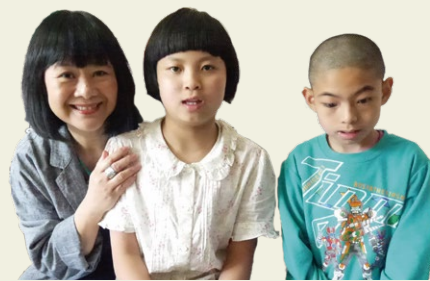
基督教勵行會成立於1985年，是香港註冊的慈善機構 Christian Action is a Hong Kong registered charitable organisation established in 1985

2020 was a difficult year for the globe. The raging COVID-19 pandemic has caused lockdowns in different countries. The world has come to a halt, with economic and social activities disrupted. Hong Kong was of no exception. Different local industries were greatly hit by the pandemic. Many people were hospitalised for COVID-19, and sadly some even lost their lives.