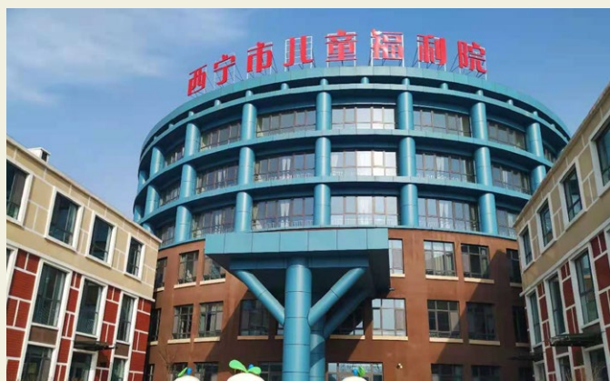
西寧市兒童福利院於2020年底遷到新址。 Xining Children's Home moved to the new site at the end of 2020.

但無論環境如何困難，我們事奉的心不會止息。在上帝的保守下，基督教勵行會的青海事工順利踏入第24年，而且有令人振奮的消息——西寧市兒童福利院於2020年12月初完成搬遷了！